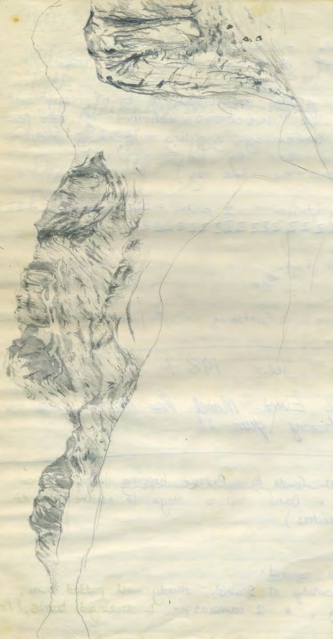
Mountain from Base Camp