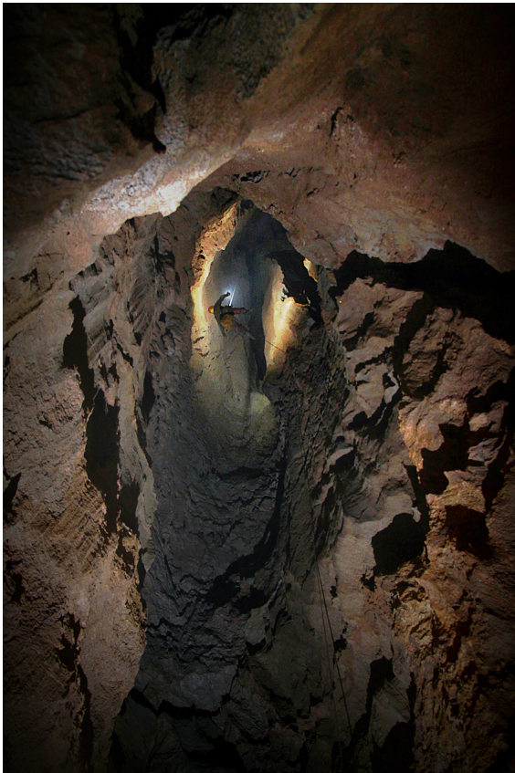
Looking up the 54m pitch.