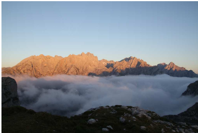
The view from Ario.